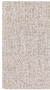
621-046 Light Grey